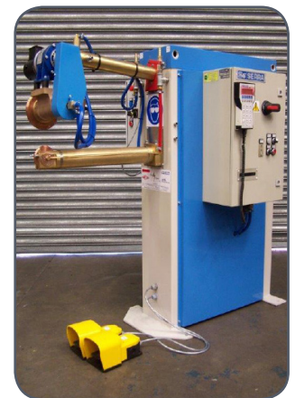
Upper Driven Longitudinal Seam Welder

Optional Extras All versions can be fitted with variable speed motorised seam welding attachments for both circumferential and longitudinal seam welding, either upper or lower driven. Also available with MEDIUM FREQUENCY transformers and controls.