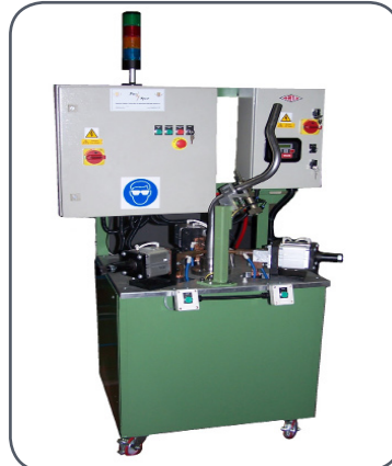
3 Headed spot welder for welding fuel hose necks