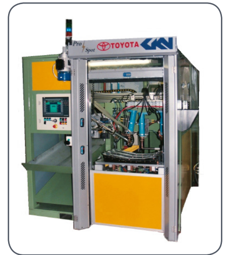
3 Headed multi projection welder with eject station