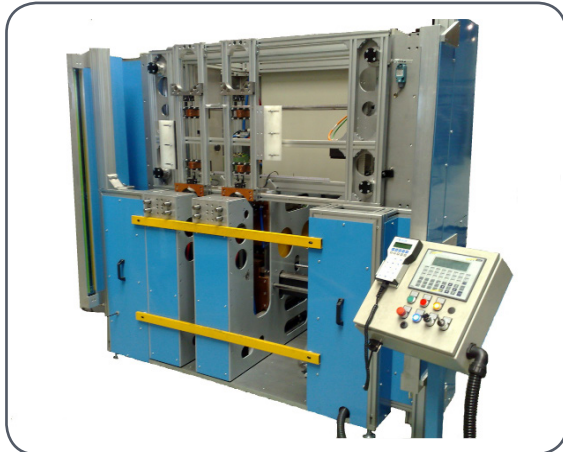
6 Headed Multi Spot Welder

Prospot has the ability to design and build special purpose welding and assembly machines for all types of welding and applications including SPOT, SPOT SEAM, BUTT, CAPACITOR, DISCHARGE and PROJECTION WELDING.