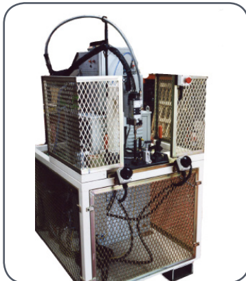
Capacitor discharge stud welding machine