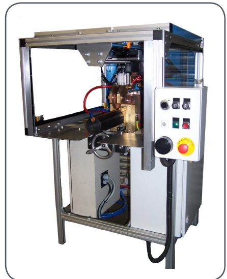
Semi automatic filter seam welder