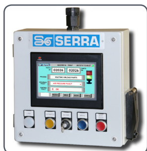
Compatible with Serra HMI