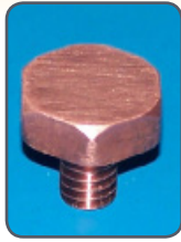
HEX01 14mm AF M6