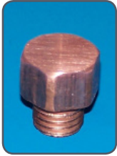
MN16C50 14mm AF M10 x 1.25