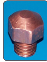
MN16C49 14mm AF 6 x 120° M10 x1.25