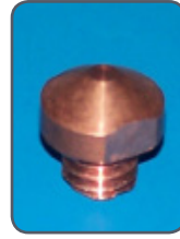
LWE 50850 12.7 Dia 3 x 120° M8