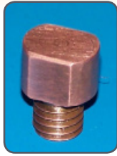
FDN-519 12.7 Dia M8