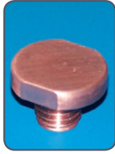
MN20C10 20mm Dia M10 x 1.25