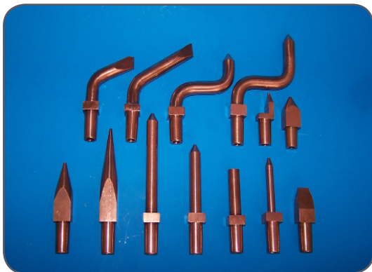
Prospot manufacture the Hirst Holden & Hunt range of electrodes.