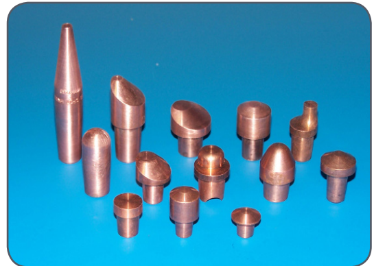
Prospot manufacture a vast range of male electrodes.