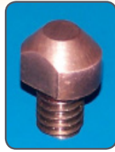
MN13C31 6 x 90° M8