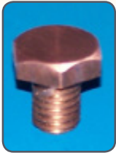
HEX03 10mm AF M6