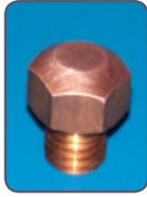
MN16C50-8 14mm AF 8 x 120° M10 x 1.25