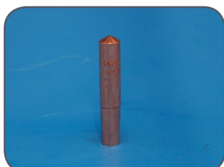
7100916 No1 Morse