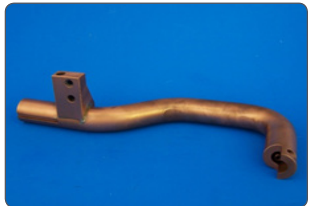
CuCrZr bent and fabricated manual gun arm