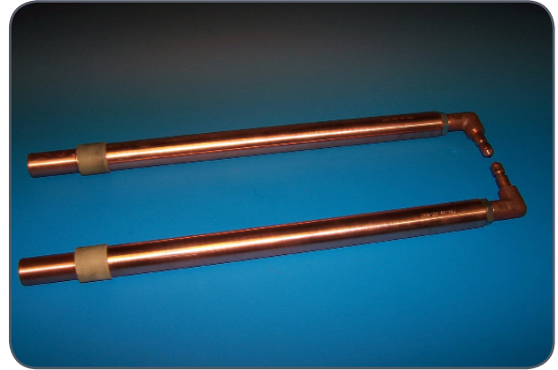
CuCrZr manual welding gun arms with cast holders