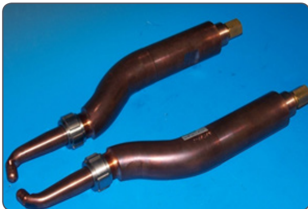
CuCrZr double bent gun arms Flat Type