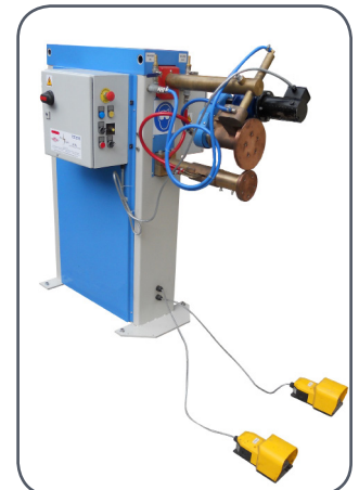
Upper Driven Circumferential Seam Welder

All of the AUTOFORGE range of rocker arm spot welders are fitted with twin foot pedals with a HIGH-LIFT facility for improving welding access and speed of production. All machines have water cooled electrodes, holders, timers and transformers. Each machine is fitted with telescopic arms enabling the machine throat to be easily adjusted without removal from the machine, provision is made for both electrode holders to be set at an angle of 20 degrees from the vertical if required. All machines can be fitted with either standard multi-program digital timer or a more sophisticated welding control with constant current control and other features.