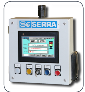
Compatible with Serra HMI