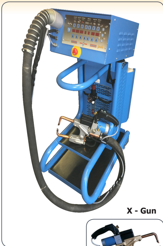
X - Gun