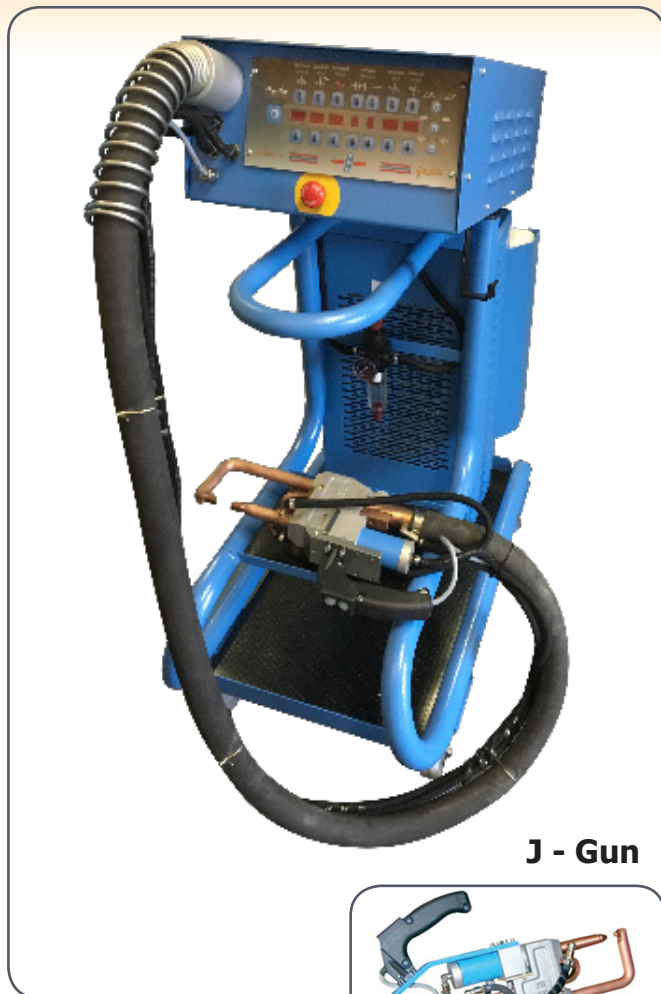
J - Gun