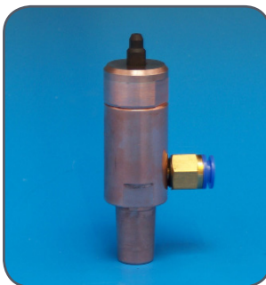
All Air or Spring Operated