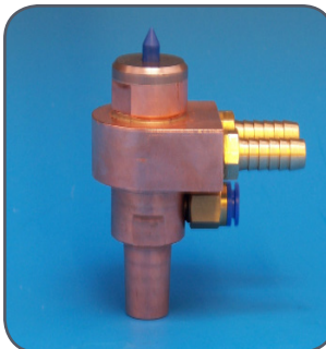
B3 3/4" BSP Thread