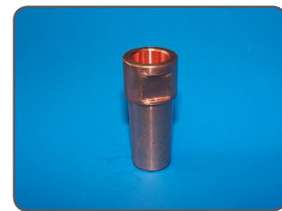
AMT16 - A13 Converts Sip Machine to use 13mm Adaptors & 13mm Caps