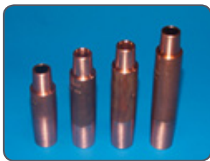
AMT16 - X X mm: 36, 41, 47, 55, 60, 69, 73, 83, 93, 97, 107