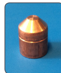
FB16_08 12mm 1:10