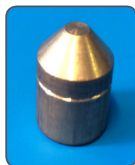
FB16_23 12mm 1:10