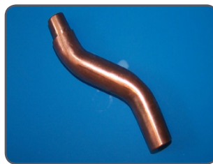
DBA16-16MT Double Bend Offset Adaptor 90mm O/L