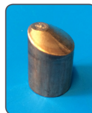
FD16_00 12mm 1:10