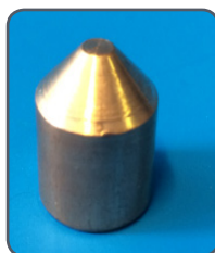
FB16_14 12mm 1:10